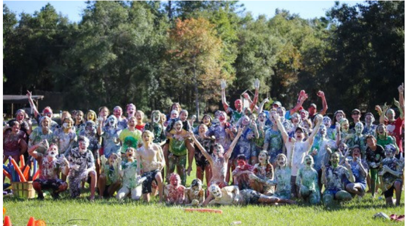
Middle School Ministry after the annual “Messy Games” competition at the Hang 10 October Weekend.