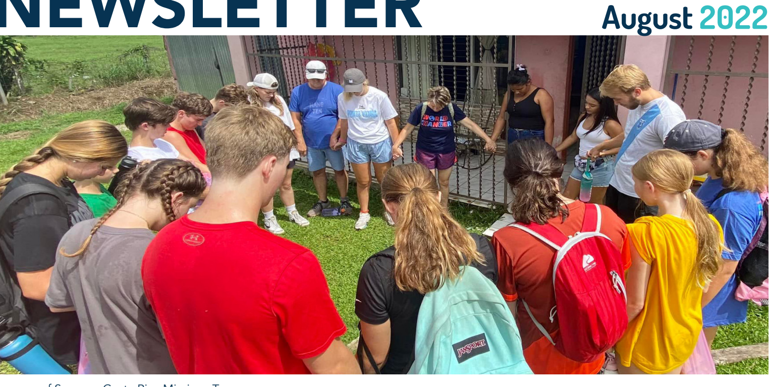
A group of Summer Costa Rica Missions Team members pray over a local family.