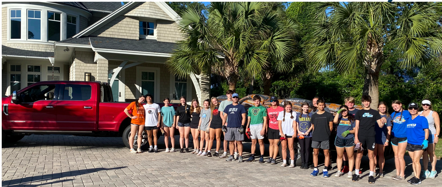
A group of summer mission team members and volunteers preparing for mulch spreading at a home.